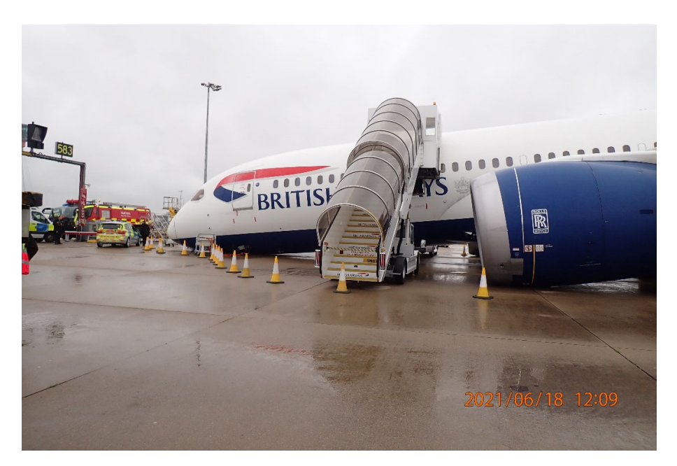
Figure 2 G-ZBJB with stairs in position at Door 2L

The aircraft's nose came to rest on the articulated arm of a ground power unit, crushing the cable arm. The aircraft sustained damage to the lower forward fuselage, NLG doors and both engine cowlings, which had also struck the ground. Door 2L had been severely damaged by contact with the stairs positioned at the door aperture as the aircraft sank onto its nose (Figure 2). The door hinges and actuating mechanism had failed and the door, which was resting on the top platform of the stairs, remained attached to the fuselage by the remains of its wiring loom.