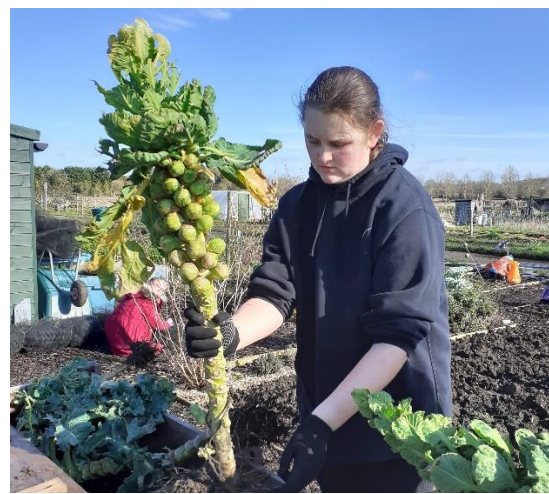
Young people working at the Old Hale Way allotment

Cllr Judi Billing has awarded a grant of £600 to help fund an allotment project for the community with a focus on young people. Due to growing demand an additional allotment plot has been added and work is needed to renovate this and put in raised beds etc and prepare it as a space people can safely use.