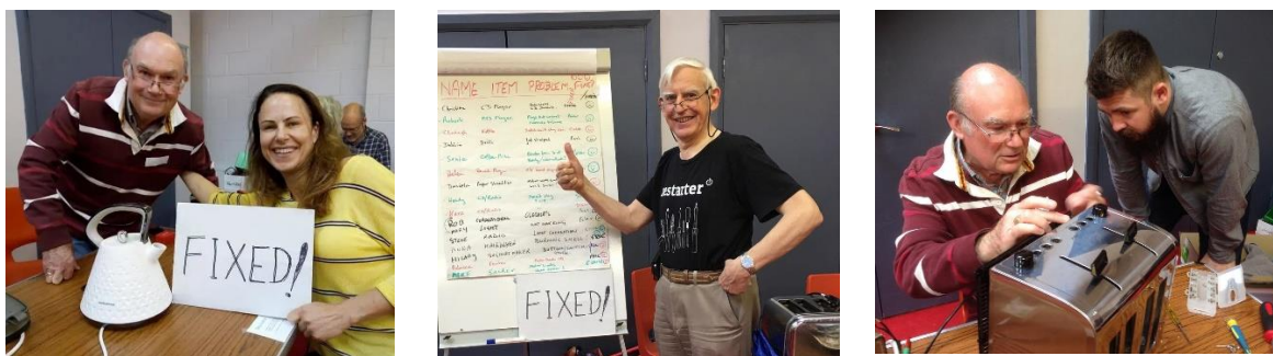
Residents repairing consumer items at the Community Centre