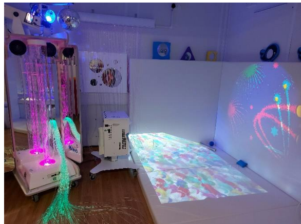
Examples of rooms in the paediatric assessment unit

Cllr Fiona Thomson has awarded a grant of £500 to help fund the SafeSpace Appeal. Providing emotional and psychological support & initiatives for the most vulnerable children in the community whilst at the paediatric assessment unit.