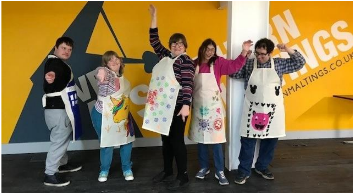
Some of the adults attending the Always Bee You group session