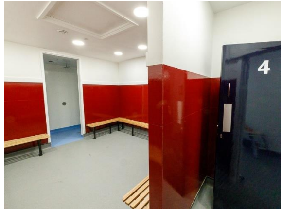
Before and after images of the changing rooms at Welwyn Rugby Club

Cllr Fiona Thomson has awarded a grant of £1000 to update the club changing facilities to include showers in every changing room. Increasing number of changing rooms from 4 to 6. Upgrading the changing facilities in the clubhouse will make them safe and fit for purpose. The Rugby Club runs 23 squads including a Women's XV and Girls at U12, U14, U16 and U18. All play and train on Sundays along with the Junior Boys. The central shower block is not used on a Sunday and the current changing facilities are not fit for purpose. The new arrangement will also eliminate all current safeguarding issues.