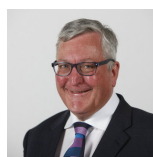
Fergus Ewing Scottish National Party