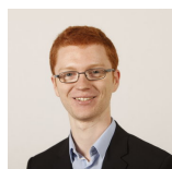
Ross Greer Scottish Green Party