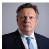
Convener Stephen Kerr Scottish Conservative and Unionist Party