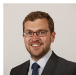
Oliver Mundell Scottish Conservative and Unionist Party