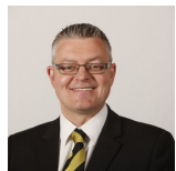
Deputy Convener Stuart McMillan Scottish National Party