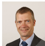
Convener Graham Simpson Scottish Conservative and Unionist Party