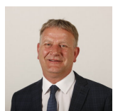
David Torrance Scottish National Party