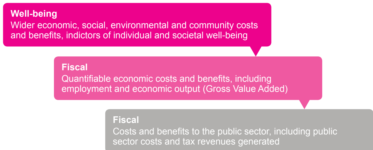
Figure 1.2: Costs and Benefits of Land Reuse

At the end of the appraisal and evaluation stage the all of the costs and benefits (from the well-being, economic and fiscal analysis), should be brought together, summarised and, where possible, quantified (whilst noting that not everything can be quantified and in some cases, that might include the most important benefits), so that the full range of costs and benefits can be understood and compared.